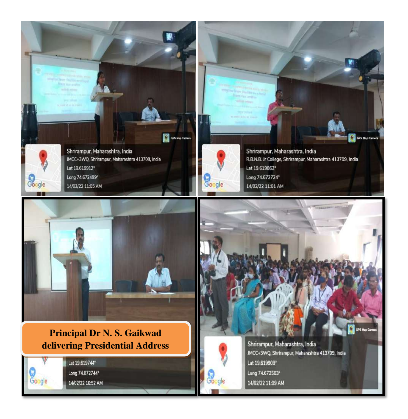
Chairman, Cultural Department