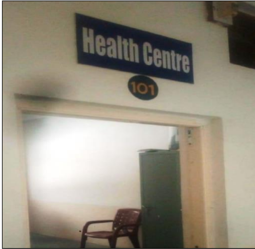
Health Care Centre