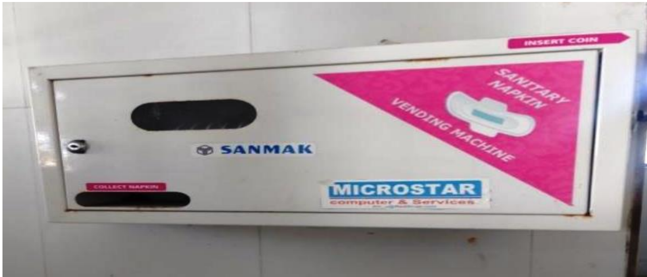
Sanitary Napkin Vending Machine